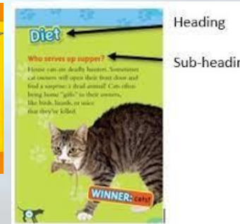
Heading and Sub-heading