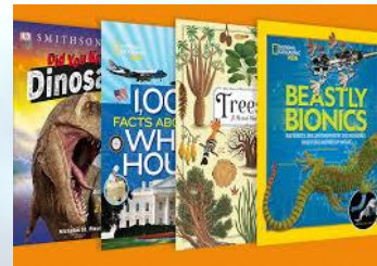
Non – Fiction Texts